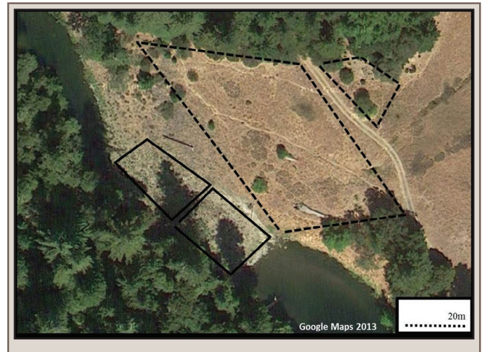
FIG. 1. A map showing approximate locations of the riparian (solid line) and upland grassland (dashed line) patches. The study site was along the Eel River at the Angelo Coast Range Reserve, Mendocino, California, USA.

Interestingly, the total number of lizards caught was similar between habitats, but the total densities of lizards were much lower in the upland habitat relative to the riparian habitat. This is likely because upland habitat was composed mainly of dry grass and was limited in the number of basking and shelter structures like boulders and logs. S. occidentalis in the upland habitat were found almost entirely on large basking substrates (logs and boulders), indicating that the species only uses a small fraction of the available habitat. Although the riparian habitats were also limited, and more so, in large basking objects, the main habitat characteristic were cobbles, which can act as refuges, thermoregulatory